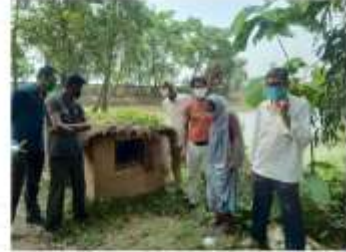
Our stakeholders: Small scale farmers in an outreach program done in our college campus

As a representative college of rural belt we concentrated on rural people and raw food wastage. Small scale farmers are the main target who are unable to use cold storage and refrigerators. So we wanted some cost effective and primitive form of techniques or mechanisms, by means of which they can store perishable fruits and vegetables for some longer period of time without developing any bacteria, moulds or fungus on them. Proposed small farmers don't use cold storage. Some people harvest and sell their veggies in the market in daily basis. Not all the veggies are sold out in the market and those are wasted. Taking the help of the proposed technique they can store their veggies atleast for 3-4 days after harvesting, without compromising any nutritional properties . The basic tool can be modified according to the need. It can be used by any poor people at their home for processed food storage also.